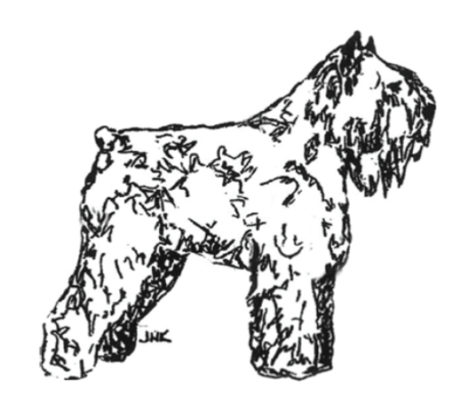
Illustration Copyright: Judy Higgins-Kasper Updated Aug 2023

A Quick Guide To Breed Type in the Bouvier des Flandres